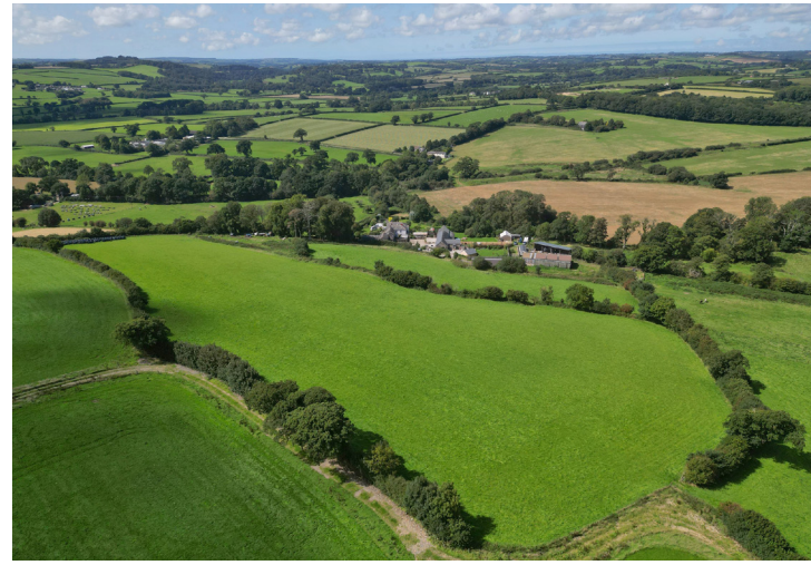
Approximately 15 Acres of Pasture, Lifton Down