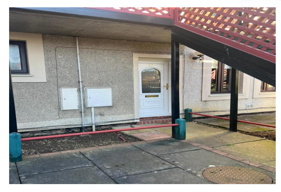
83 Kingsmere Gardens, Walker, Newcastle upon Tyne £58,000

An amazing opportunity to purchase a stunning 2 bedroom lower flat situated on Kingsmere Gardens.