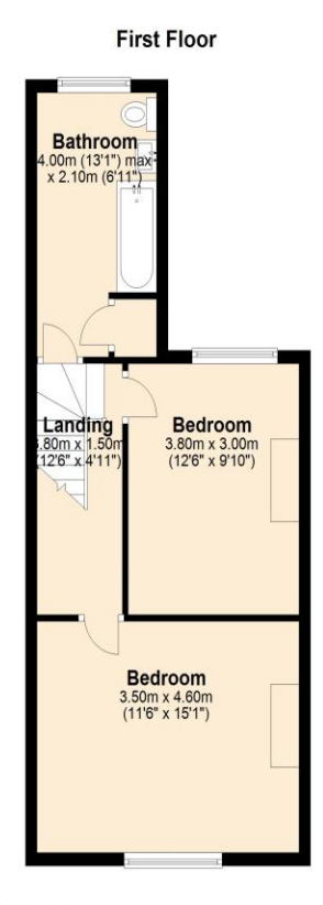
72 MARSH STREET, Barrow