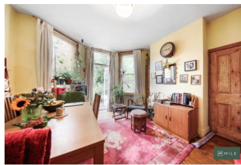
Radcliffe Avenue, London NW10 £585,000 Leasehold

Welcome to Radcliffe Avenue, where this charming two-bedroom garden apartment awaits. With a 92-year lease, this home offers the perfect blend of classic character and modern convenience. Enjoy the privacy and exclusivity of your own entrance, leading into a welcoming living space adorned with original features that add a touch of timeless elegance. The apartment boasts a delightful private garden, ideal for outdoor dining, relaxation, or gardening. Nestled on a lovely road with good neighbours, you'll find a sense of community and tranquillity that's hard to beat. With potential to extend, this property offers room to grow and customize to your liking. Whether you're a first-time buyer, a downsizer, or seeking a pied-à-terre, this apartment has everything you need to create a comfortable and inviting home. Don't miss the opportunity to make Radcliffe Avenue your new address.