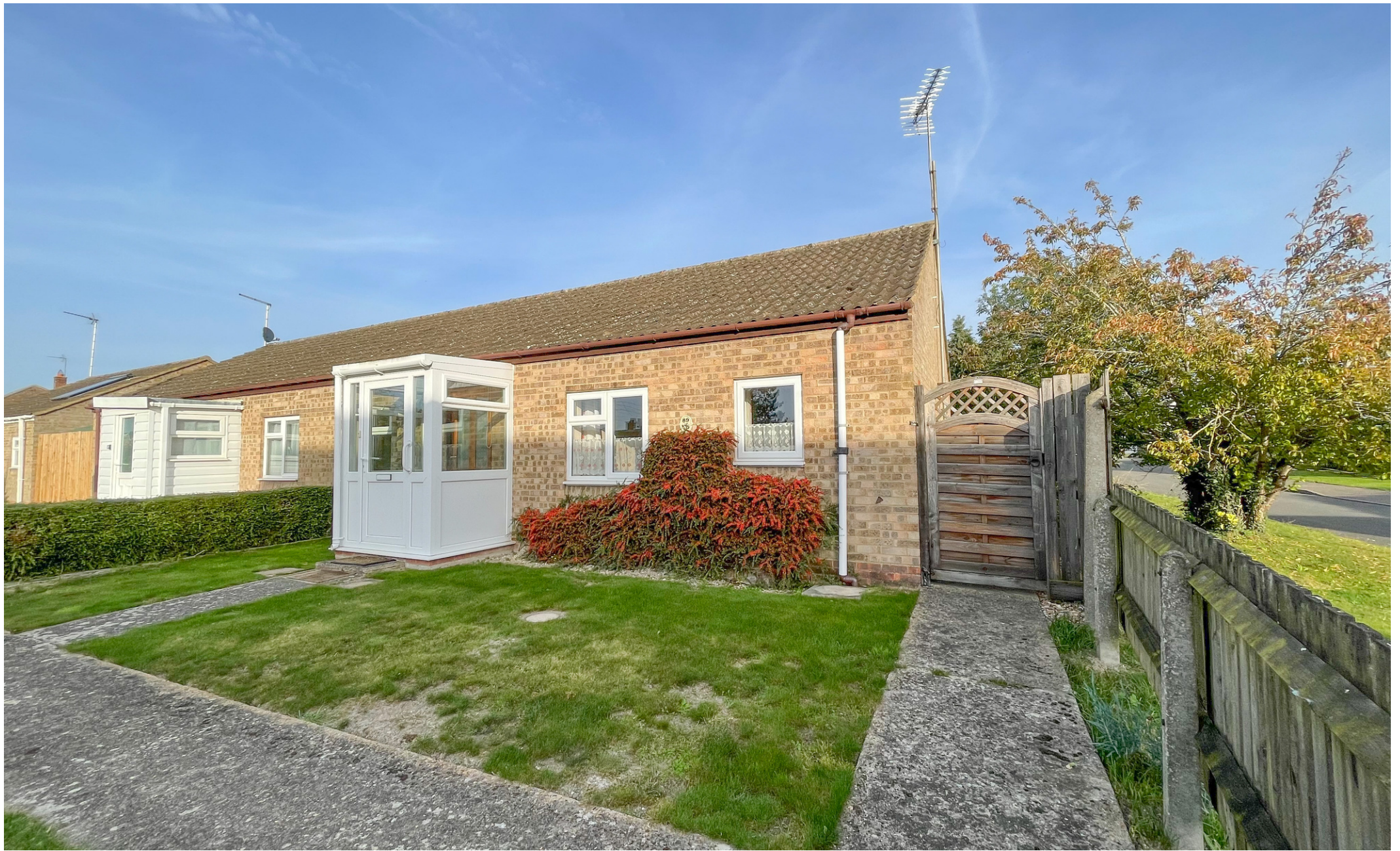
Low Road, Burwell