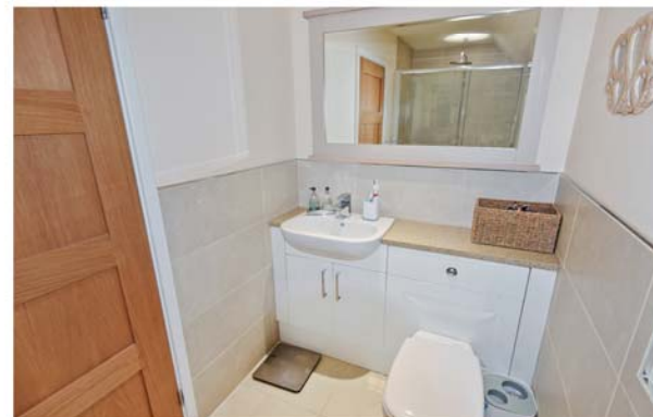
Principle Bedroom & Ensuite