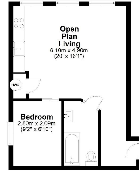
Total area: approx. 34.2 sq. metres (368.7 sq. feet) Produced by Lewis White, not to scale and indicative only Plan produced using PlanUp.

First Floor Approx. 34.2 sq. metres (368.7 sq. feet)