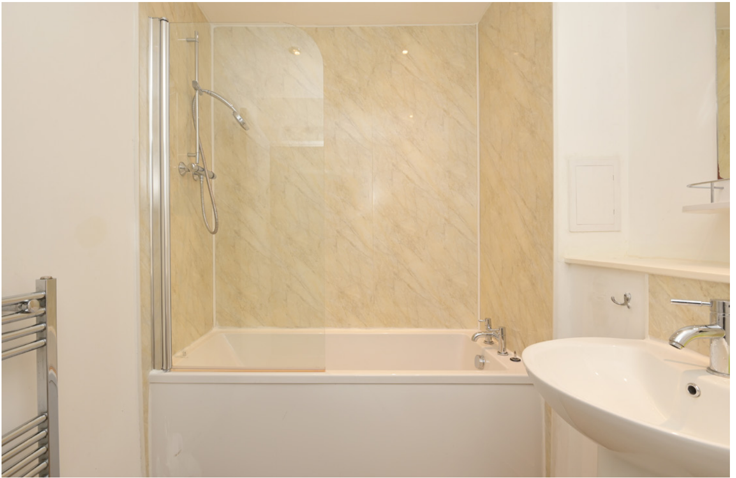
A modern three-piece bathroom is conveniently located off the hallway.