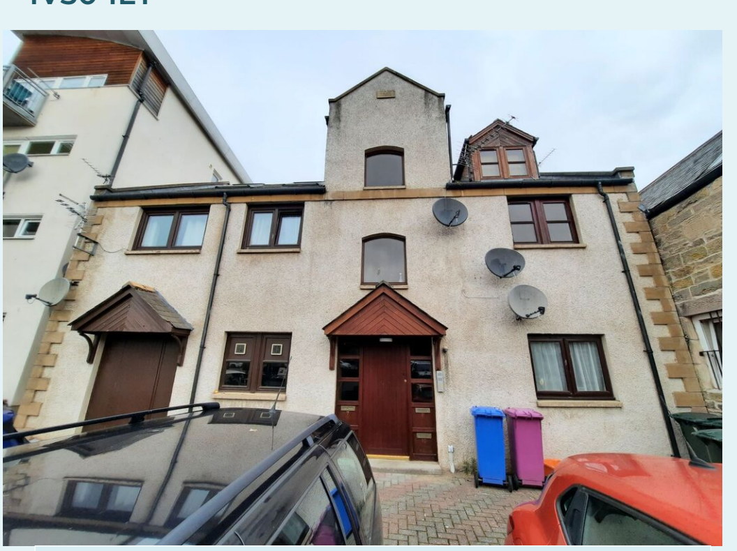
No Smokers & No Pets 2 Bedroom Mid Floor Flat

Communal Entrance Door Hallway, Lounge, Kitchen, 2 Bedrooms, Bathroom Space in the Kitchen to accommodate a washing machine & a fridge