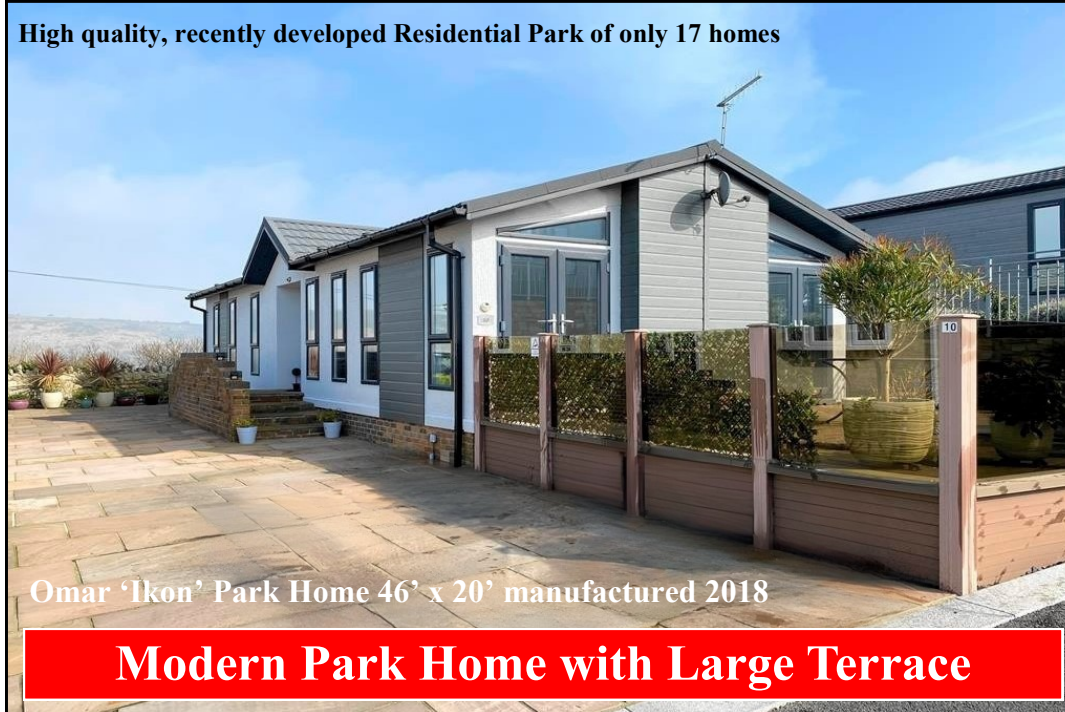
Omar 'Ikon' Park Home 46' x 20' manufactured 2018

High quality, recently developed Residential Park of only 17 homes