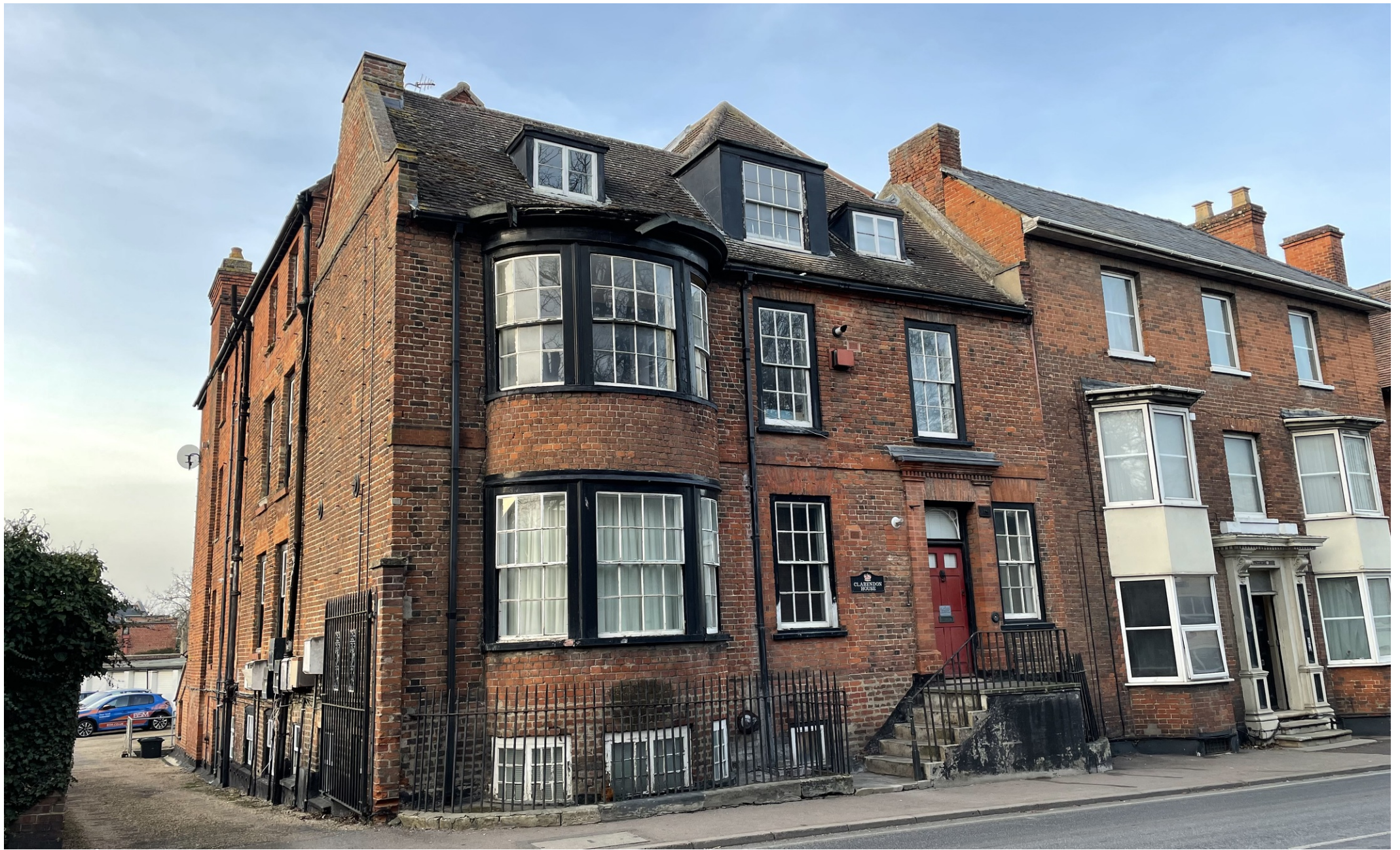
Clarendon House, High Street, Newmarket