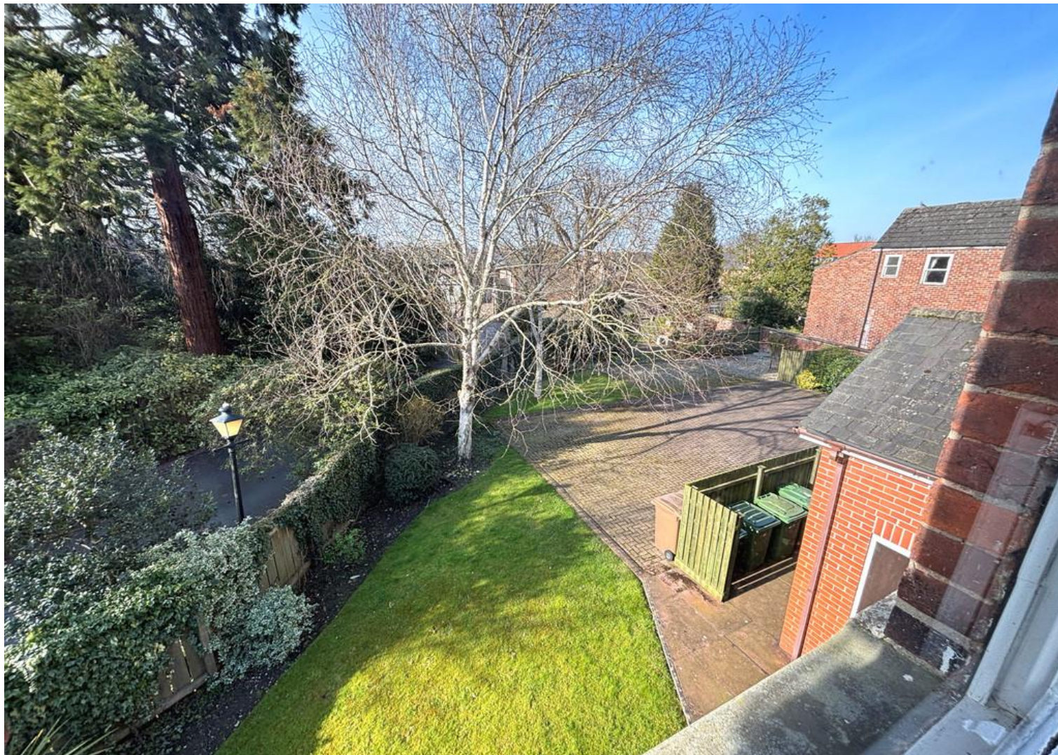
View from window