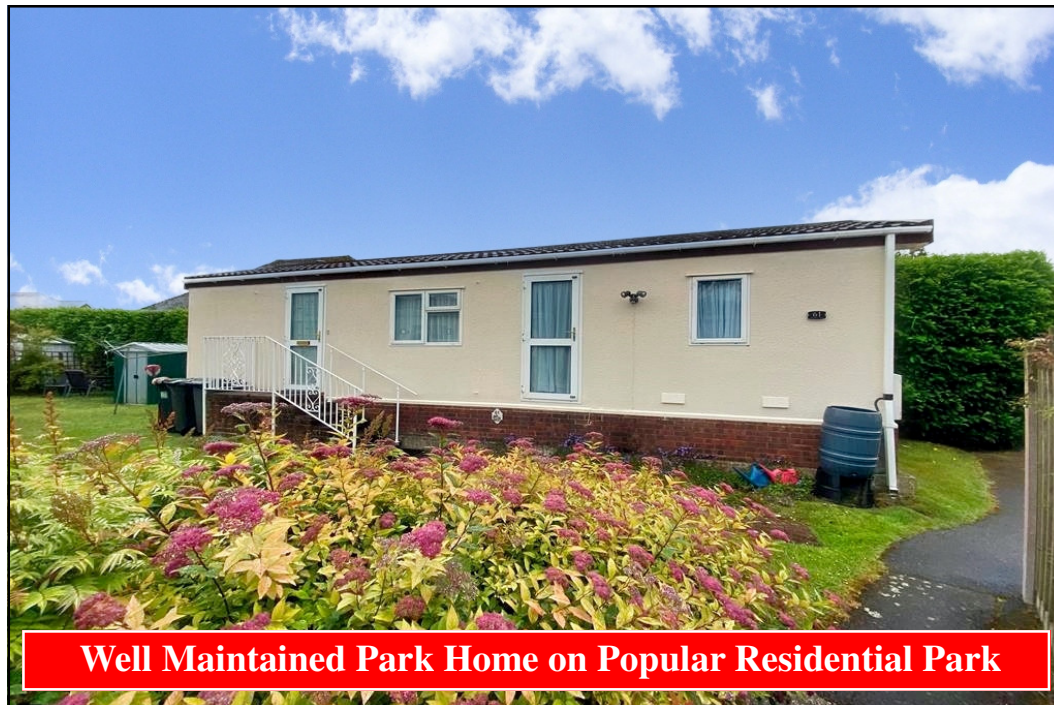
Well Maintained Park Home on Popular Residential Park

61 Doveshill Park, Barnes Road, Bournemouth. BH10 5AJ