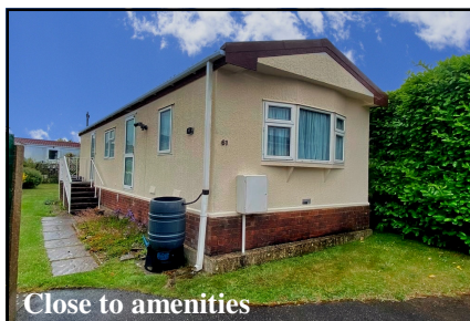
Close to amenities