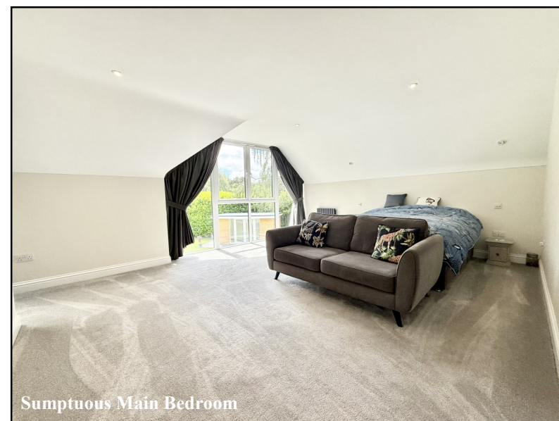
Sumptuous Main Bedroom