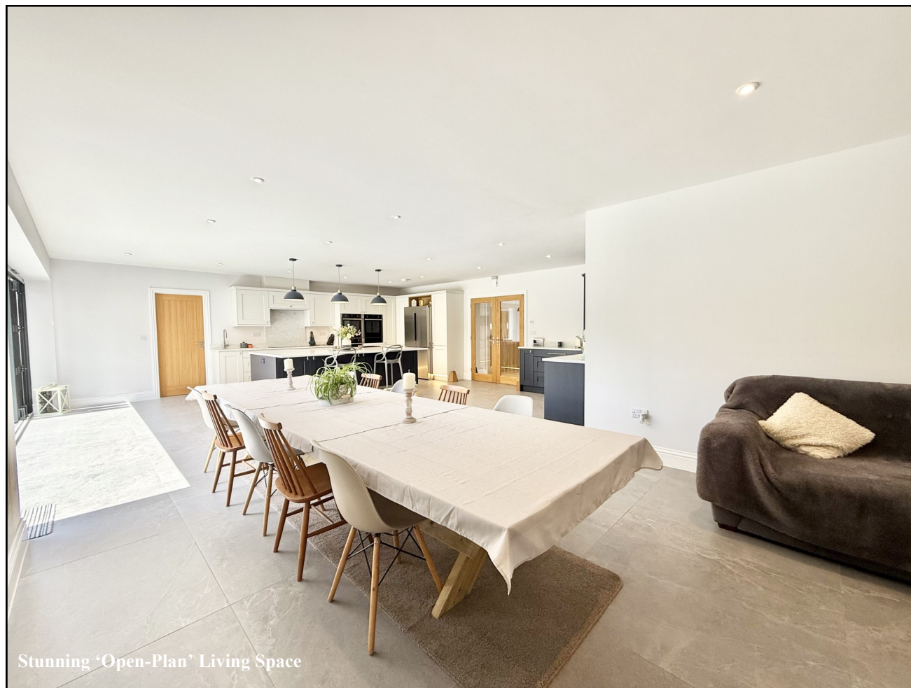
Stunning 'Open-Plan' Living Space