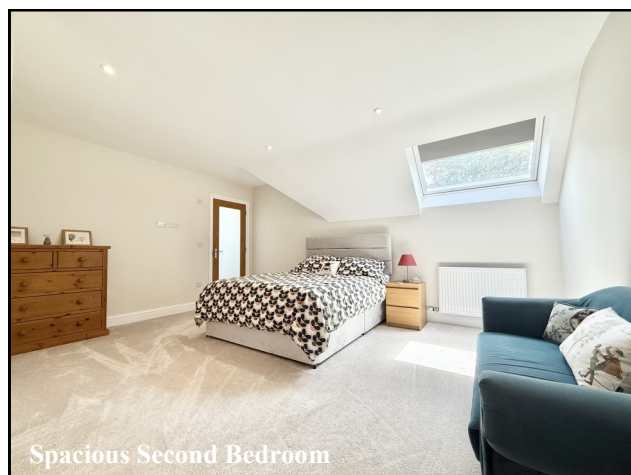
Spacious Second Bedroom