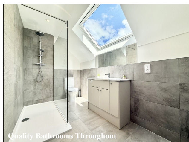
Quality Bathrooms Throughout