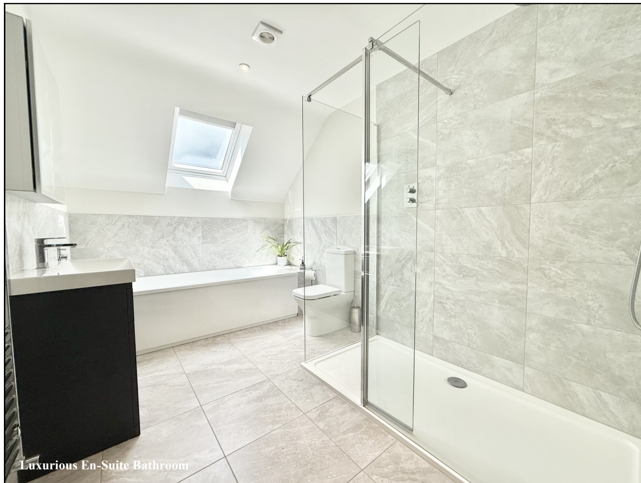
Luxurious En-Suite Bathroom