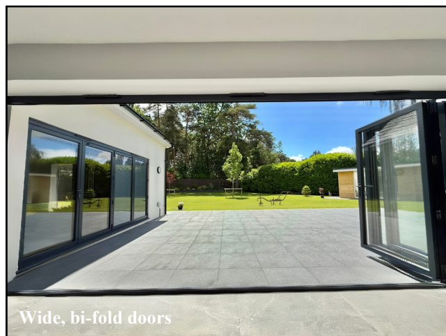
Wide, bi-fold doors