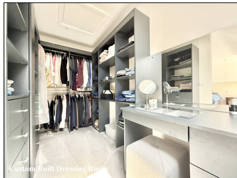
Custom Built Dressing Room