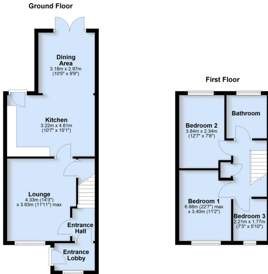
25 Park Avenue, Driffield

The stated EPC floor area, (which may exclude conservatories), is approximately 82 sq m