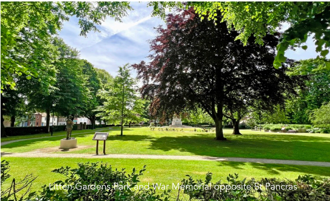
Litten Gardens Park and War Memorial opposite St Pancras

Southerly facing rear garden Short walk to city centre and park