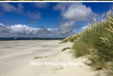
West Wittering Beach