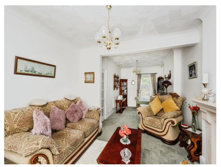
11' 4" x 9' 1" ( 3.45m x 2.77m )