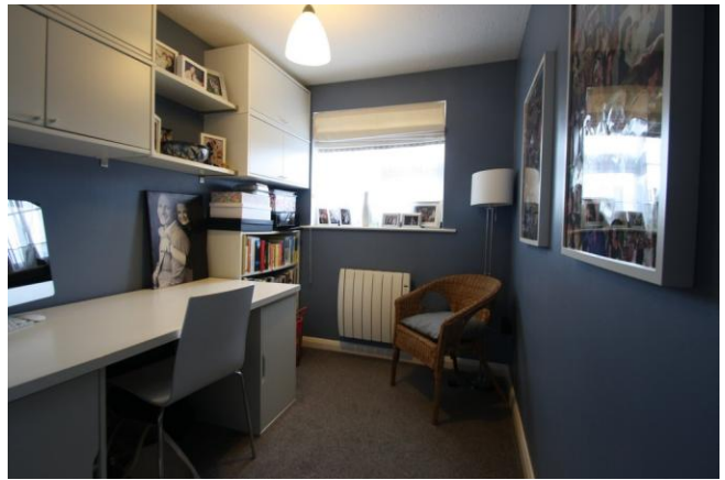
where our story begins