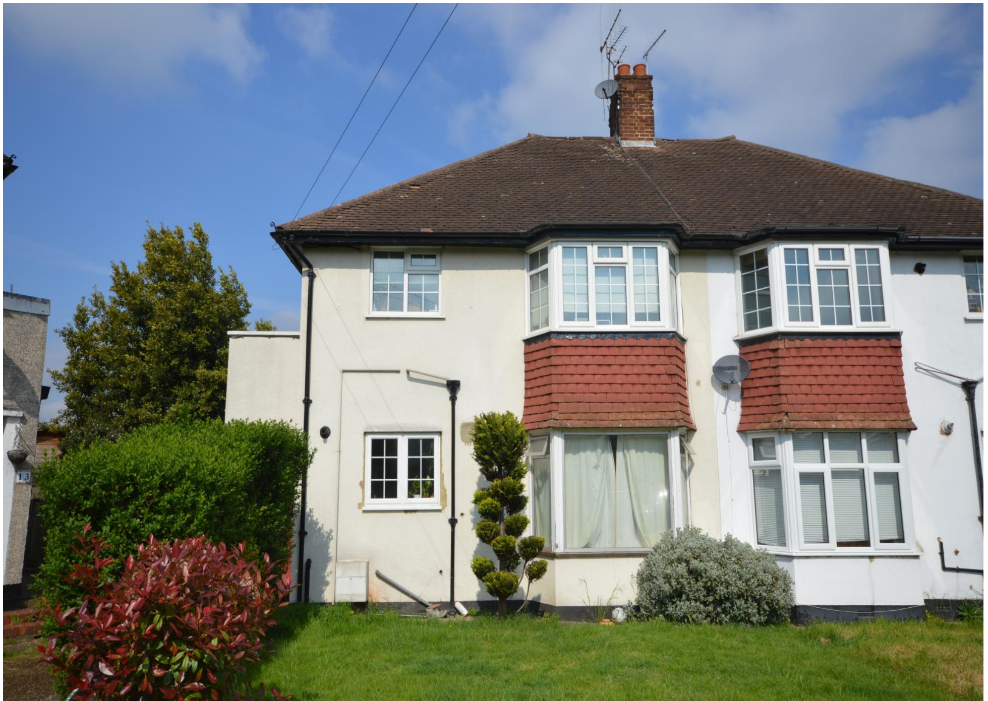
Grove Close, Kingston Upon Thames, Surrey £375,000