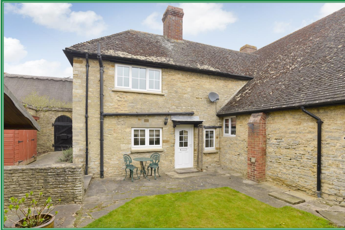
East Cottage, Merton Road, Ambrosden, Bicester, Oxfordshire, OX25 2LZ