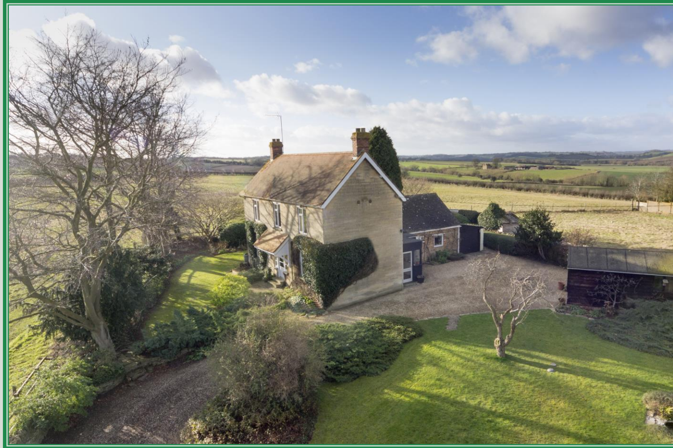
The White House, Danes Hill, Duns Tew, Bicester, Oxfordshire, OX25 6JD