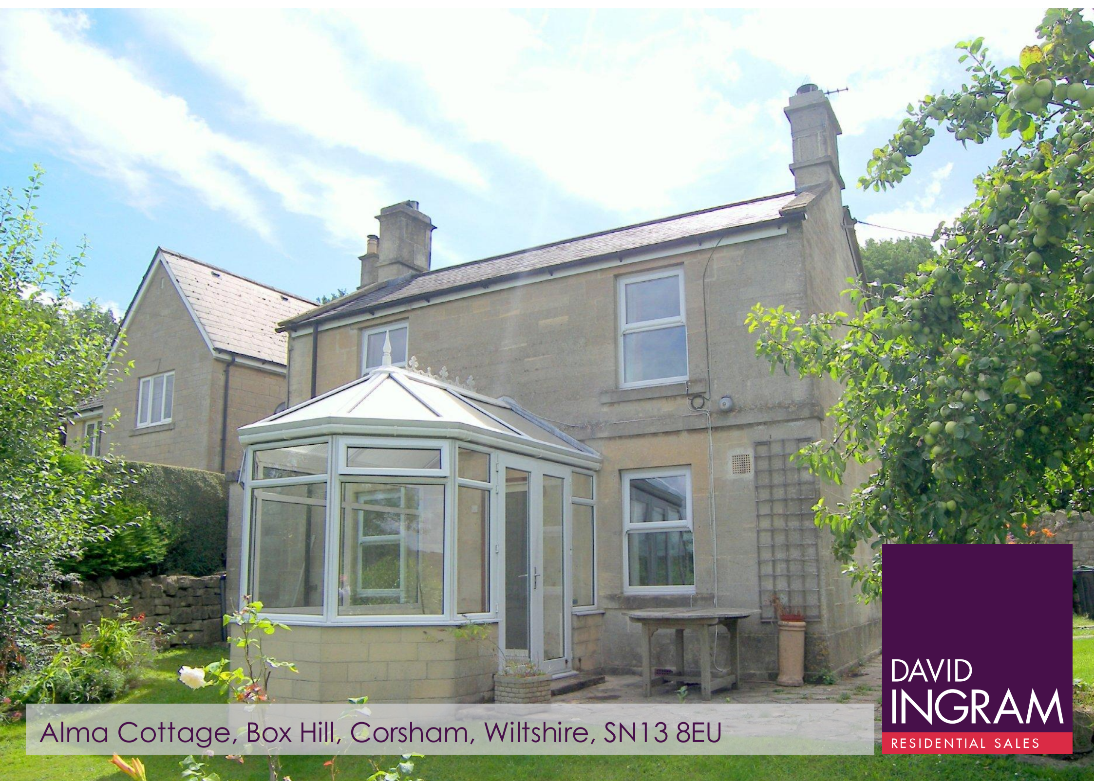
Alma Cottage, Box Hill, Corsham, Wiltshire, SN13 8EU

ALMA COTTAGE, BEECH ROAD, BOX HILL, CORSHAM, SN13 8EU TOTAL APPROX. FLOOR AREA 1048 SQ.FT. (97.3 SQ.M.) Schematic Diagram only - Not to scale Made with Metropix ©2017