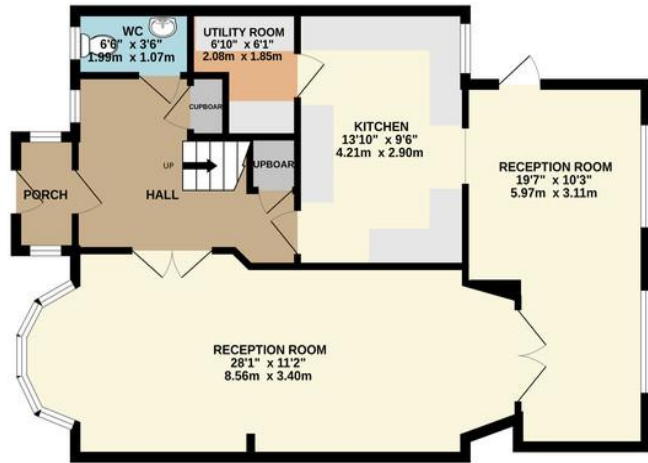
GROUND FLOOR 766 sq.ft. (71.1 sq.m.) approx.