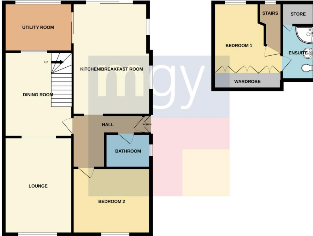
TOTAL FLOOR AREA : 1063 sq.ft. (98.8 sq.m.) approx.

Whilst every attempt has been made to ensure the accuracy of the floorplan contained here, measurements of doors, windows, rooms and any other items are approximate and no responsibility is taken for any error, omission or mis-statement. This plan is for illustrative purposes only and should be used as such by any prospective purchaser. The services, systems and appliances shown have not been tested and no guarantee as to their operability or efficiency can be given. Made with Metropix ©2022