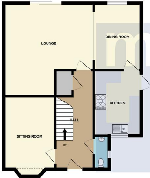
GROUND FLOOR 610 sq.ft. (56.7 sq.m.) approx.