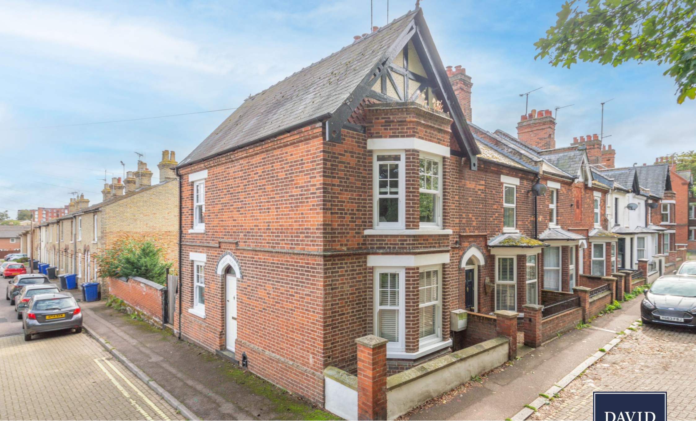
Farley House 1 Brazilian Terrace, Newmarket