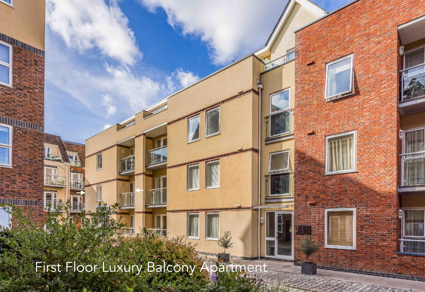
First Floor Luxury Balcony Apartment