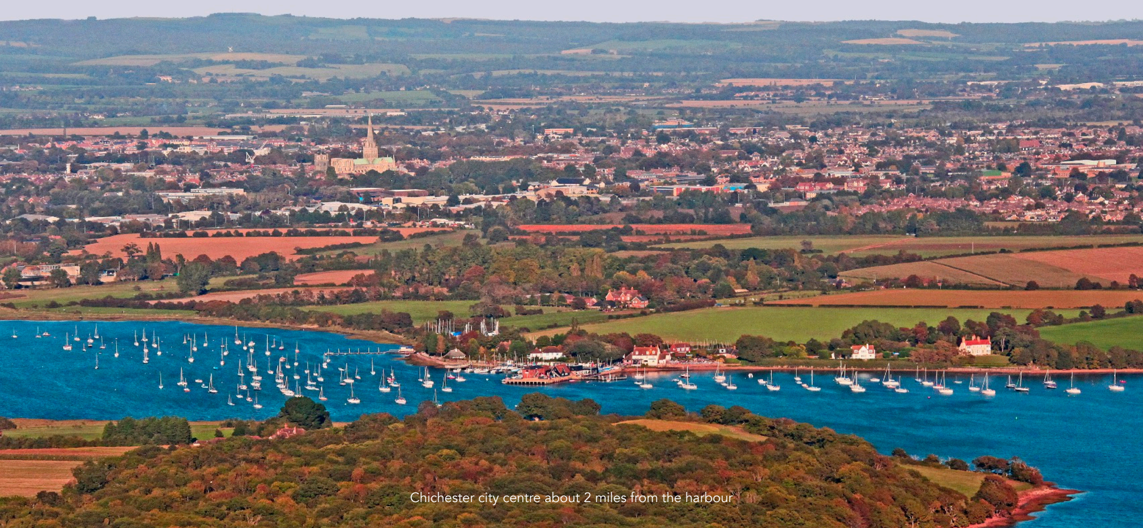
Chichester city centre about 2 miles from the harbour