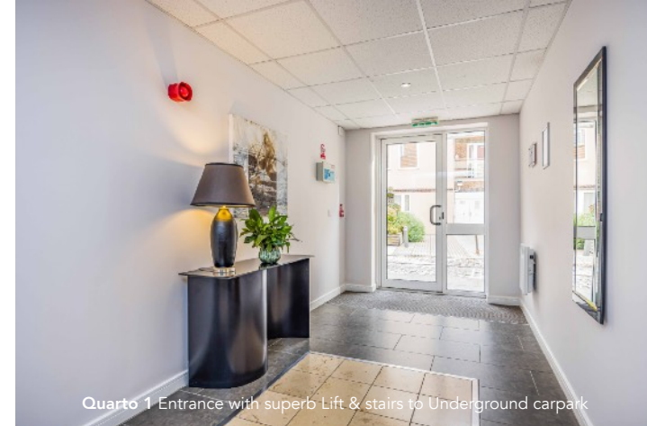
Quarto 1 Entrance with superb Lift & stairs to Underground carpark