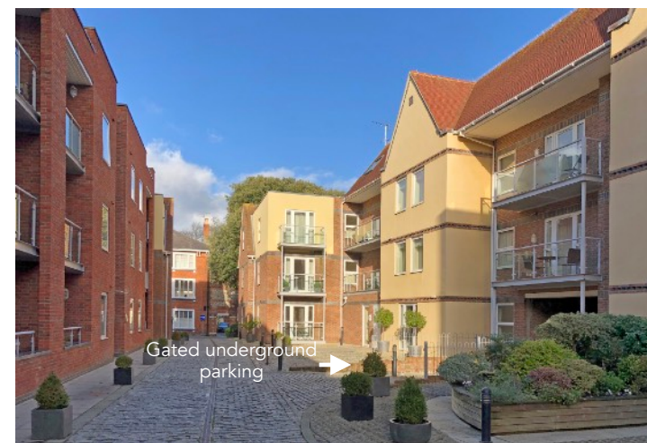
Gated underground parking