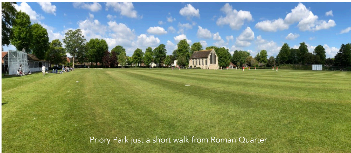
Priory Park just a short walk from Roman Quarter

Ground Rent 2023/24: £515.20 pa Reviewed in line with RPI every 15yrs