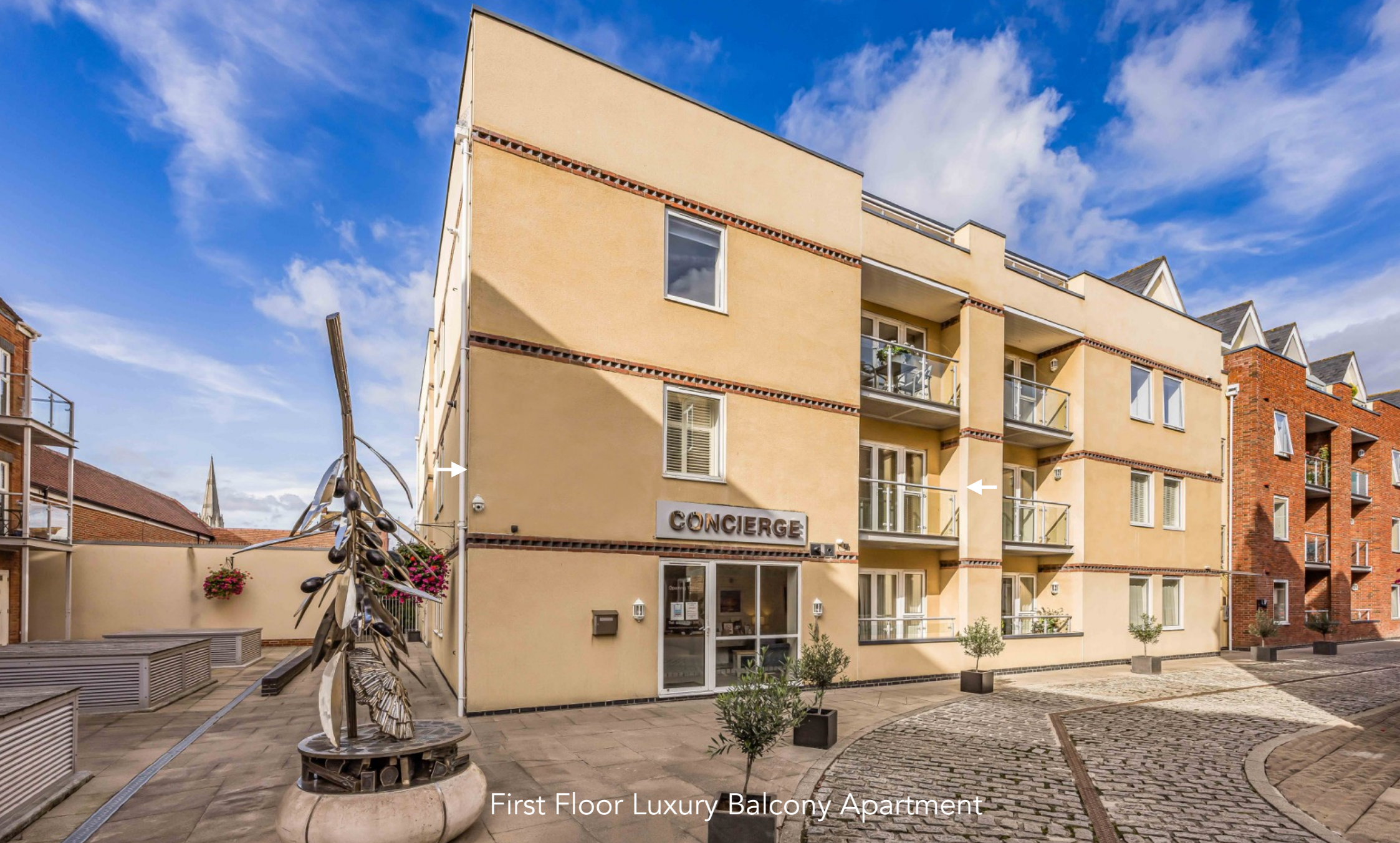
First Floor Luxury Balcony Apartment