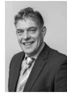
Professional photography MARK BRYCE Photographer