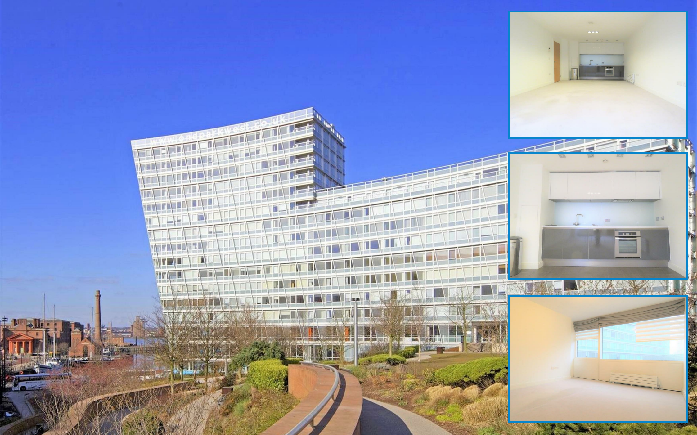
C308 One park West Kenyons Steps, Liverpool , Merseyside L1 3BH £145,000