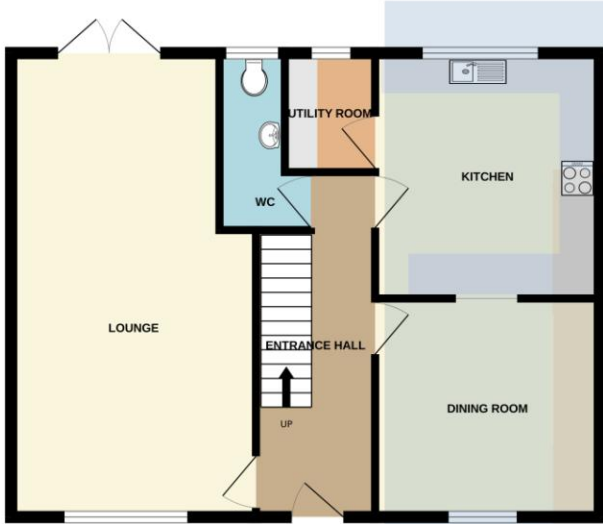
GROUND FLOOR 637 sq.ft. (59.2 sq.m.) approx.