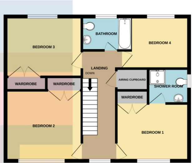
1ST FLOOR 637 sq.ft. (59.2 sq.m.) approx.