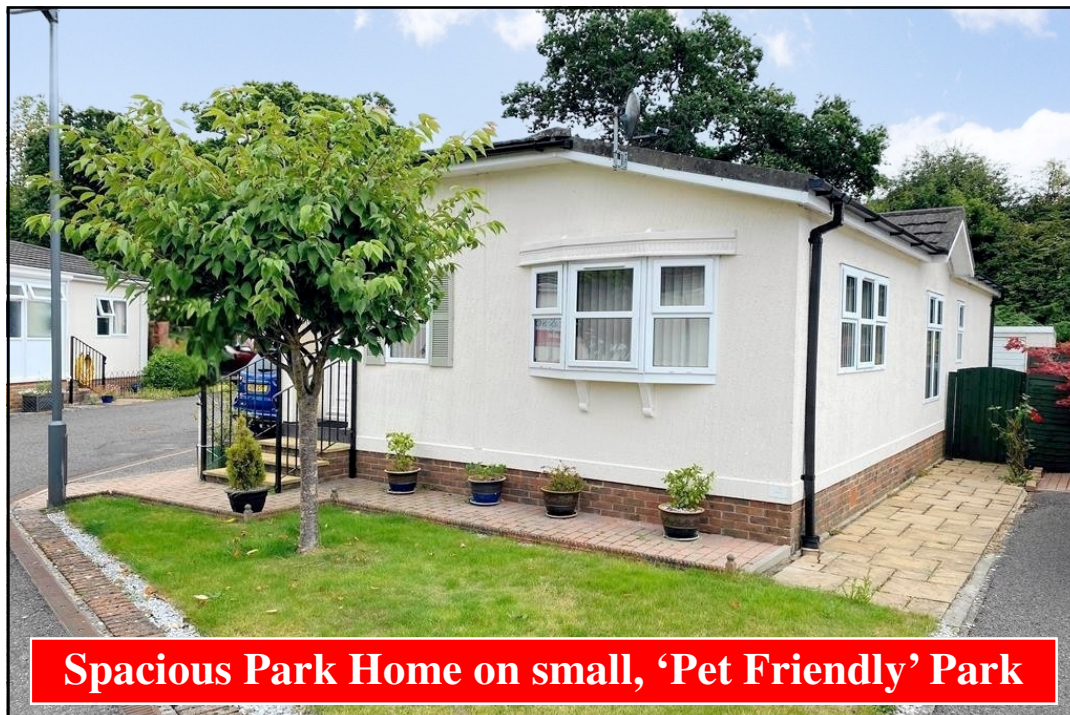
Spacious Park Home on small, 'Pet Friendly' Park

4 Crystal Hollow, Southampton Road, Godshill, Fordingbridge. SP6 2JJ