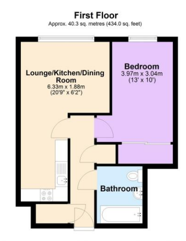
Total area: approx. 40.3 sq. metres (434.0 sq. feet)