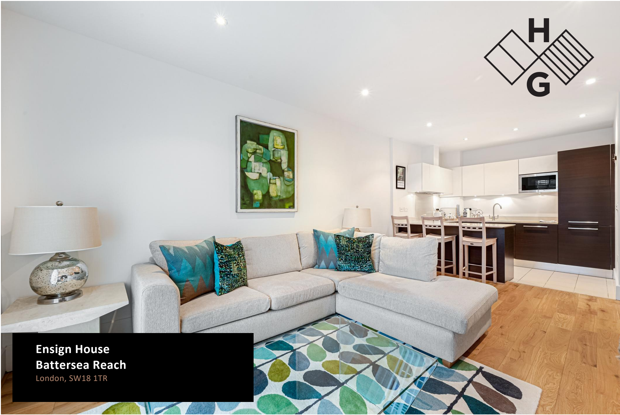
Ensign House Battersea Reach London, SW18 1TR