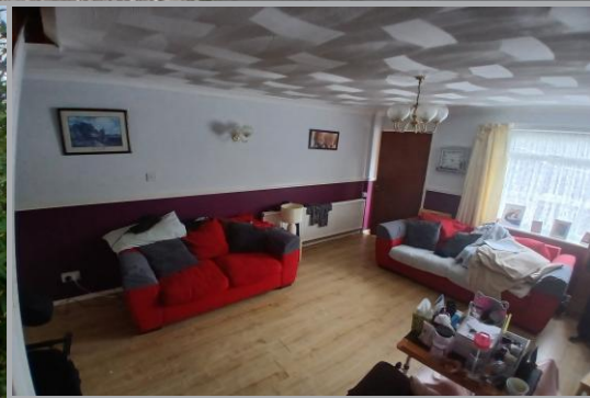
10 Steggall Close | Needham Market | Suffolk | IP6 8EB

Specialist marketing for | Barns | Cottages | Period Properties | Executive Homes | Town Houses | Village Homes