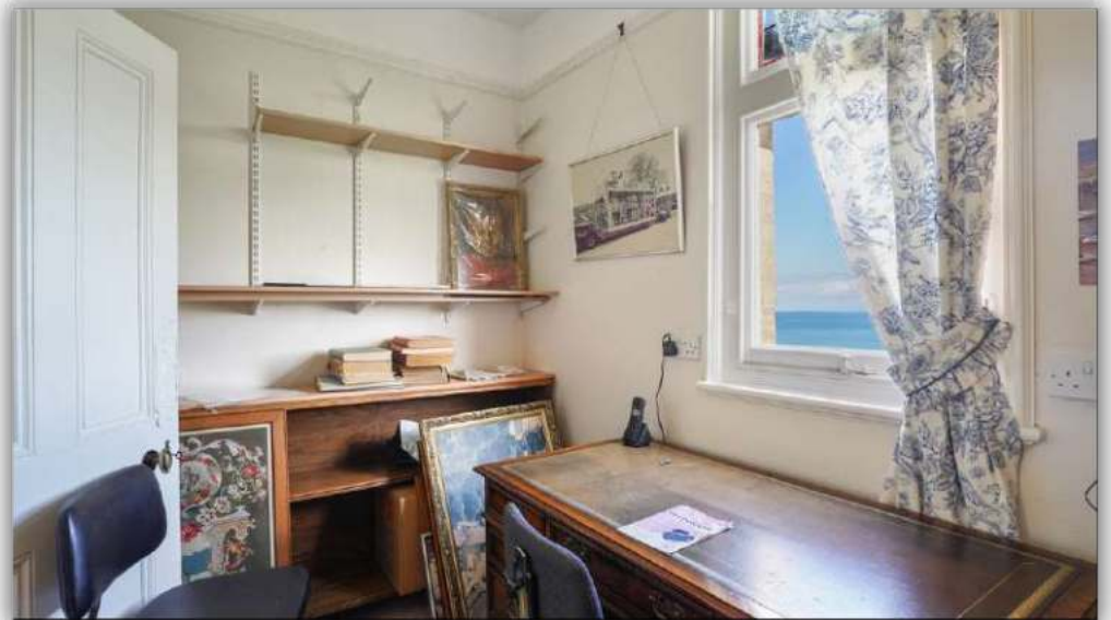
Bedroom 4/Study Sea Views