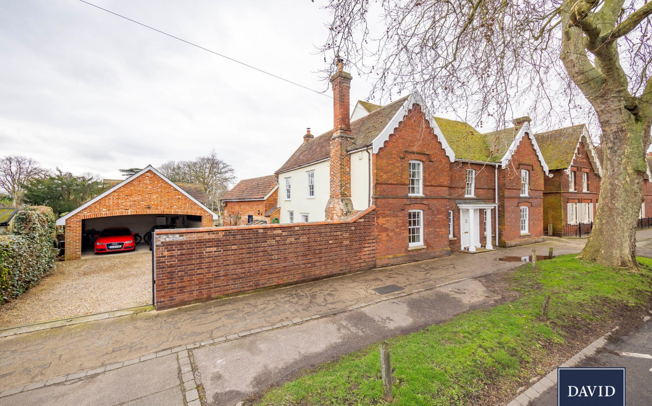
The Gables, Hall Street, Long Melford, Suffolk