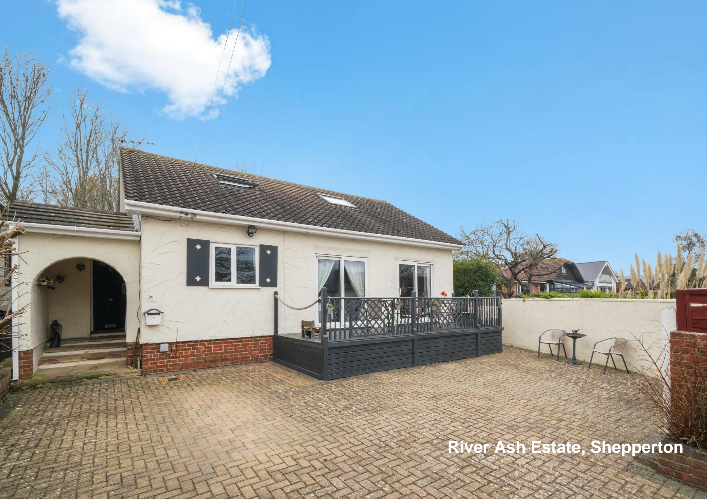
River Ash Estate, Shepperton