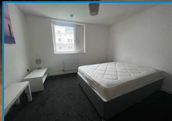
Apartment 187, 7 Royal Quay, Liverpool , L3 4EY £950