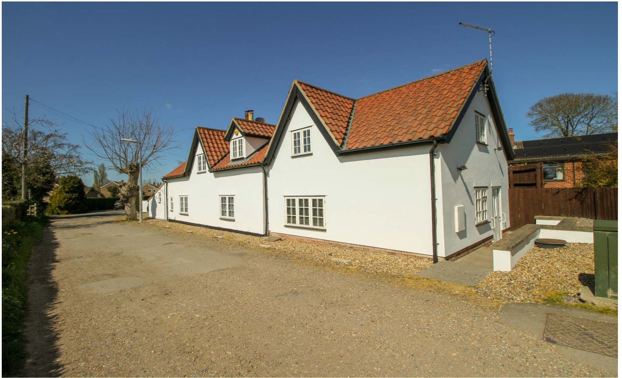
Spring Close Burwell Cambridgeshire