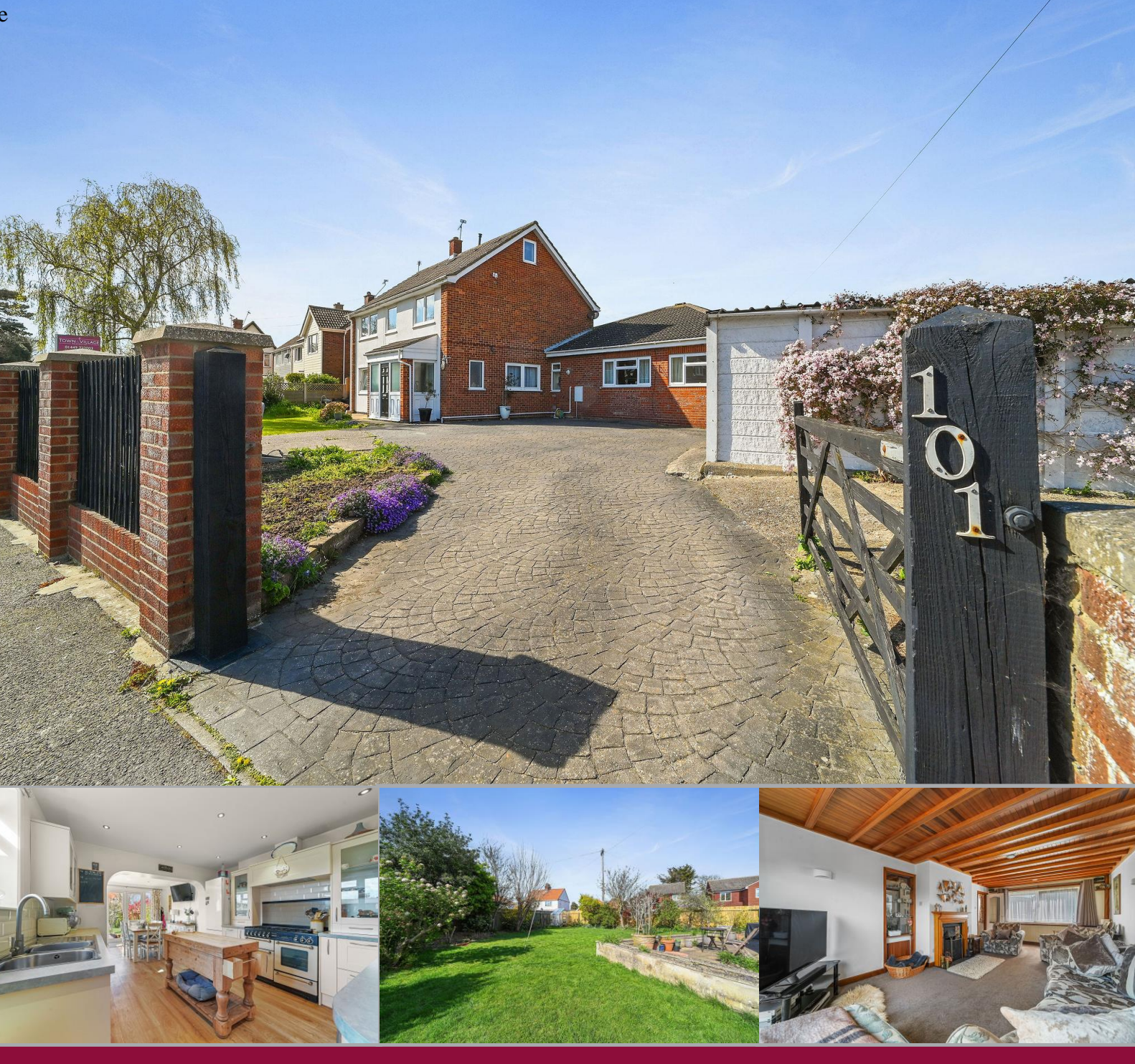
The Mouse House | 101 High Road East | Felixstowe | IP11 9PT

Specialist marketing for | Barns | Cottages | Period Properties | Executive Homes | Town Houses | Village Homes