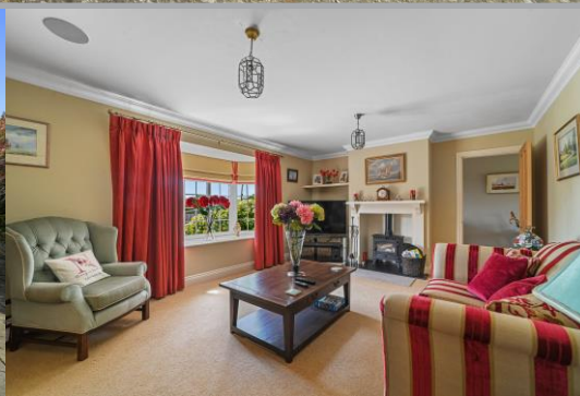
Cuttings | Jacks Green | Creeping St Mary | IP6 8NB

Specialist marketing for | Barns | Cottages | Period Properties | Executive Homes | Town Houses | Village Homes