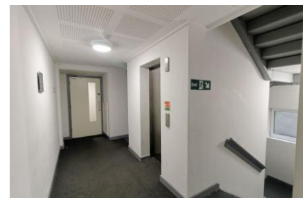
GROUND FLOOR 581 sq.ft. (54.0 sq.m.) approx.