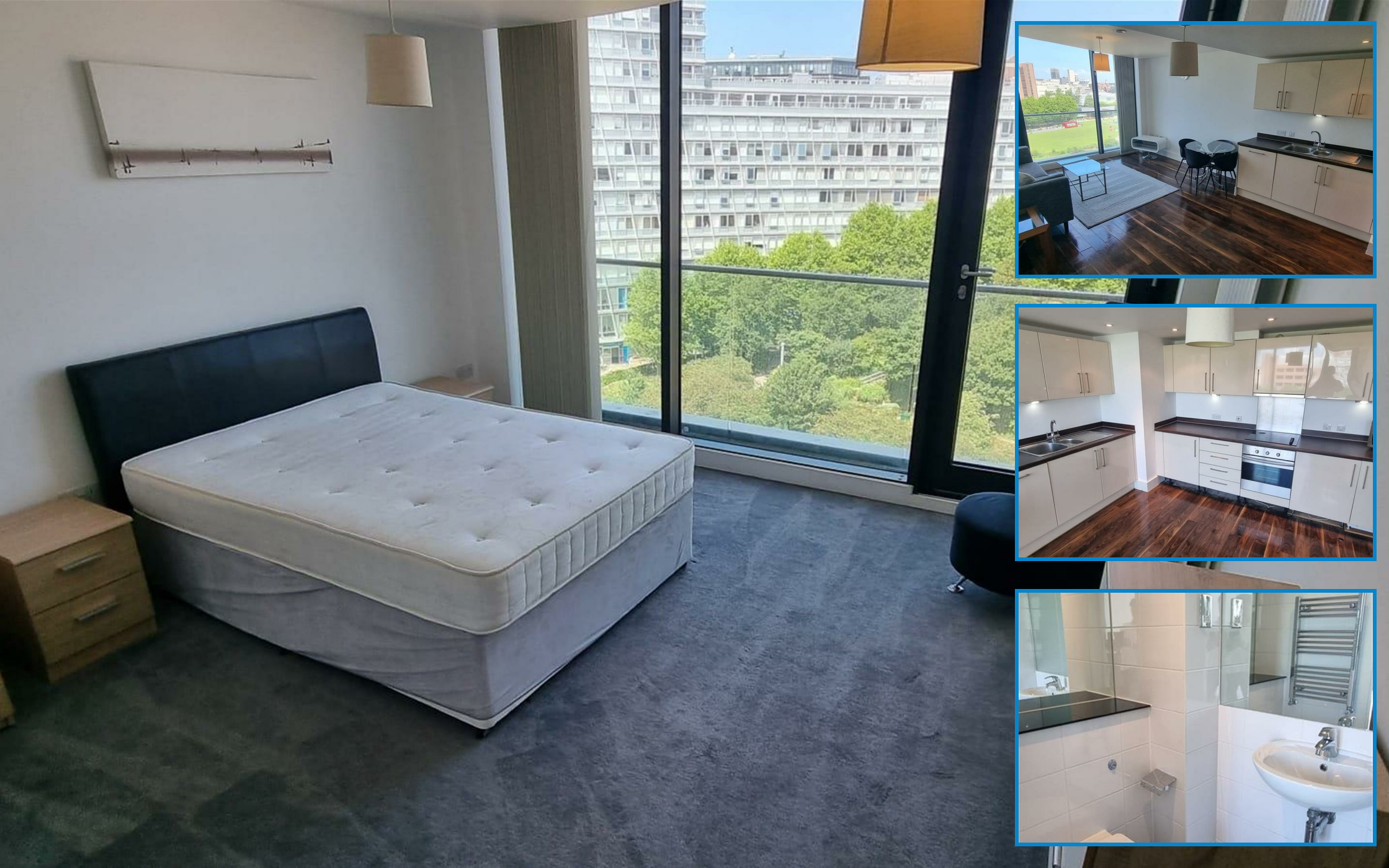
Apartment 805, 2 Custom House Place, Liverpool , L1 8LZ £1,350