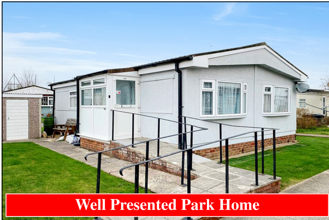
Well Presented Park Home

42a Selwood Park, Weymans Avenue, Kinson, Bournemouth. BH10 7JU