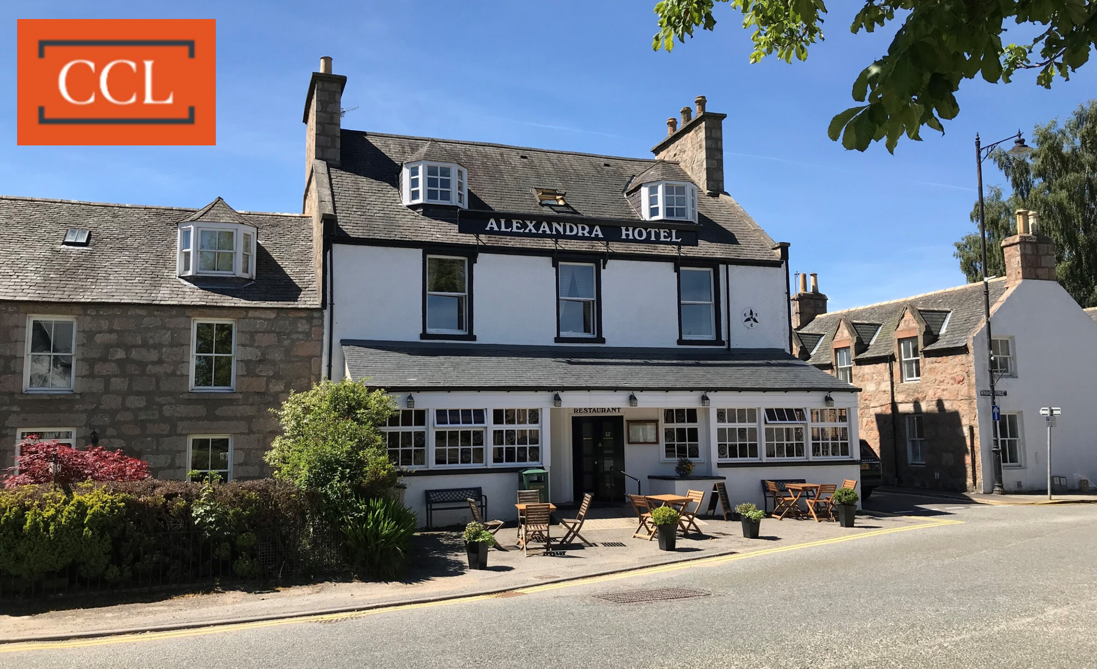
Alexandra Hotel, 12 Bridge Square, Ballater, Aberdeenshire