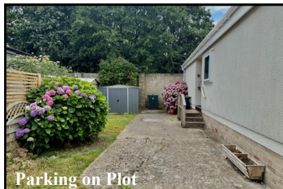
Parking on Plot