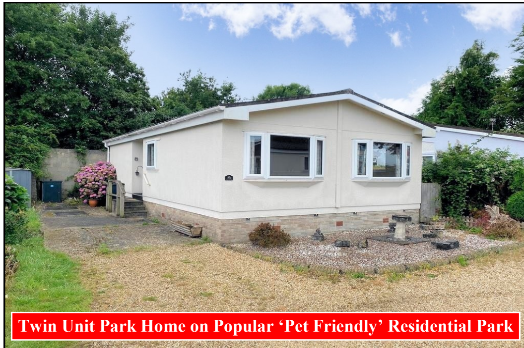
Twin Unit Park Home on Popular 'Pet Friendly' Residential Park

29 Oaklands Park, Crossways, Dorchester. DT2 8JQ