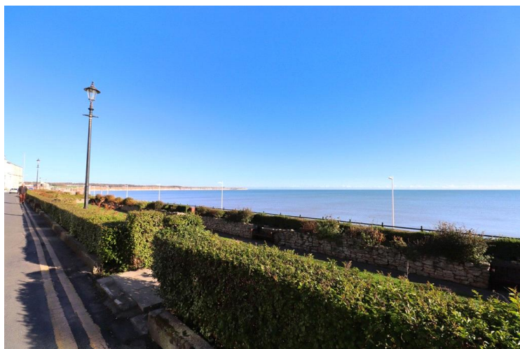
Close Sea Views