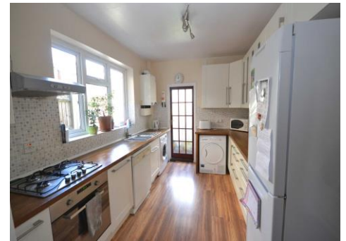
Adelaide Road, London £550,000