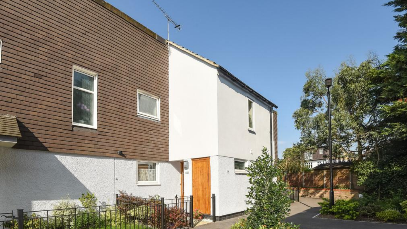
Domville Close, Whetstone, N20