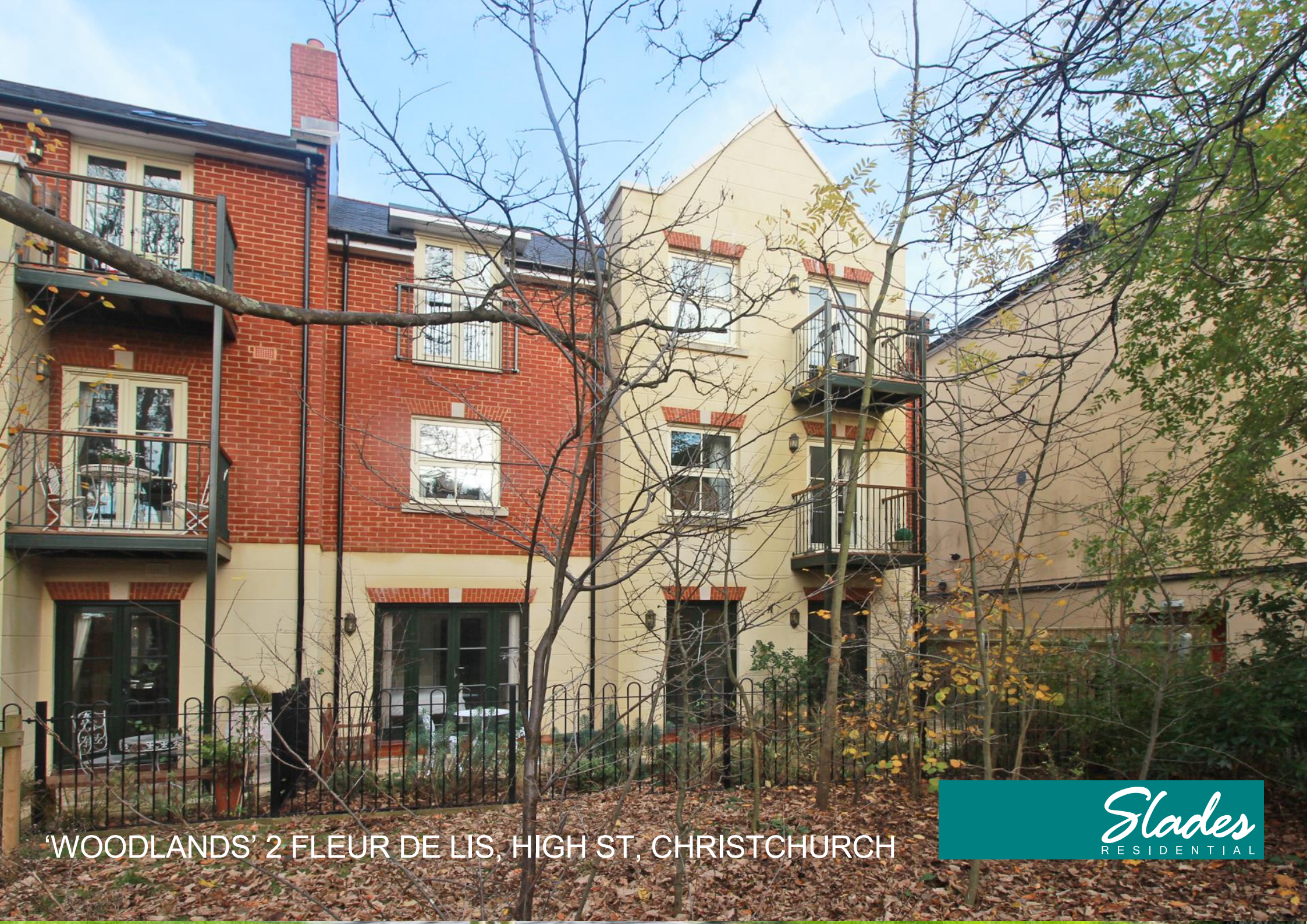
'WOODLANDS' 2 FLEUR DE LIS, HIGH ST, CHRISTCHURCH